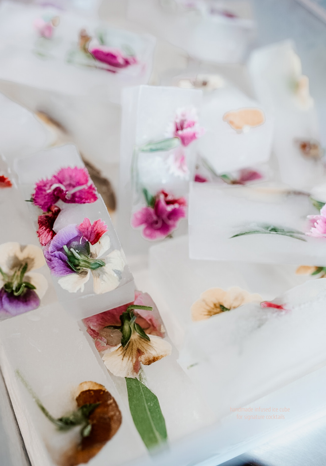
handmade infused ice cube for signature cocktails